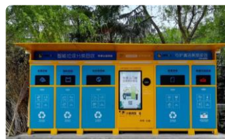
Garbage sorting box