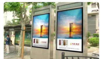
Outdoor advertising machine