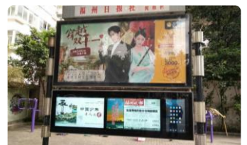
Outdoor newspaper column